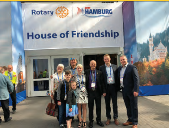
Friends United at Rotary International Convention in Germany